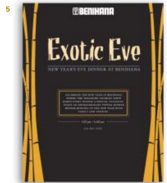
1. Epic Restaurant Theme Poster 2. Library Bar Martini Menu 3. Fairmont Corporate Christmas Card